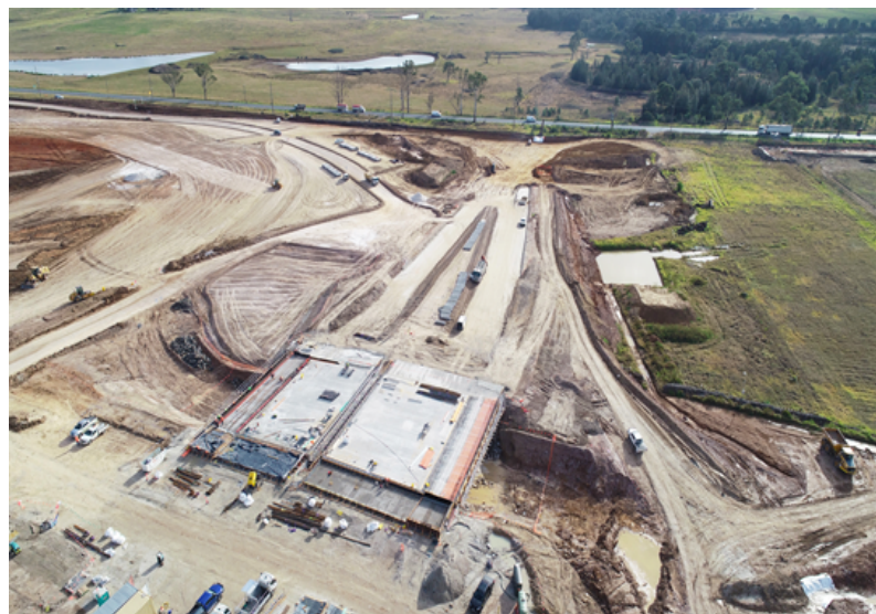
Badgerys Creek Road Realignment at Elizabeth Drive, July 2019

We look forward to working closely with our neighbours as we work to deliver Early earthworks for Western Sydney International and will continue to update you as work progresses with the construction of the Airport.